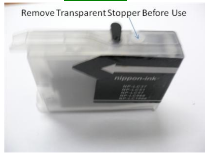
Remove Transparent Stopper